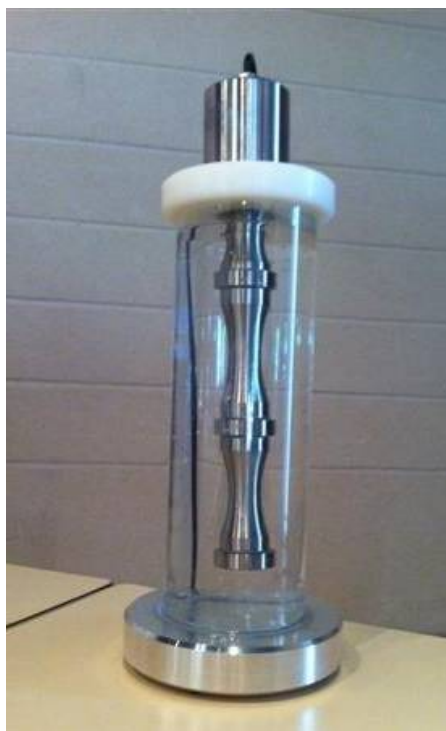
20kHz Radial Probe inserted in a tube